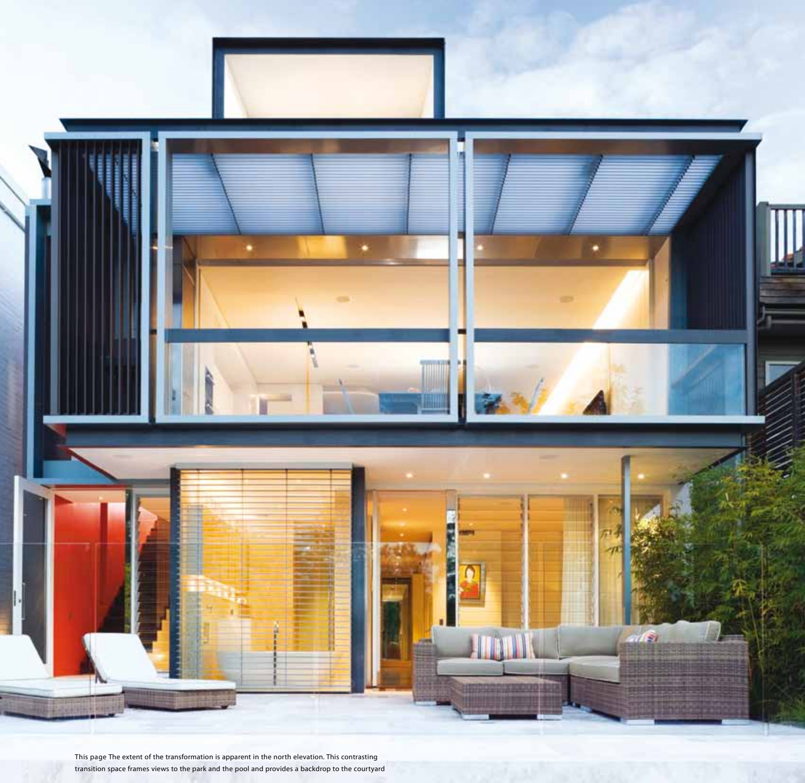
This page The extent of the transformation is apparent in the north elevation. This contrasting transition space frames views to the park and the pool and provides a backdrop to the courtyard

The timber stair – accentuated by its unmissable orange slot-windowed eastern wall – leads down to the newly excavated level. The deck opens out to a pool and the view across the overlooking park is simply breathtaking. Stanic has taken advantage of this northern aspect so that the house's site seems to literally reach out and touch this huge expanse of nature. It doesn't, of course, but the architect's treatment of the rear balcony, the use of glass for the rear facade and the build's clean structural lines makes the cross-over of interior and exterior spaces seamless.